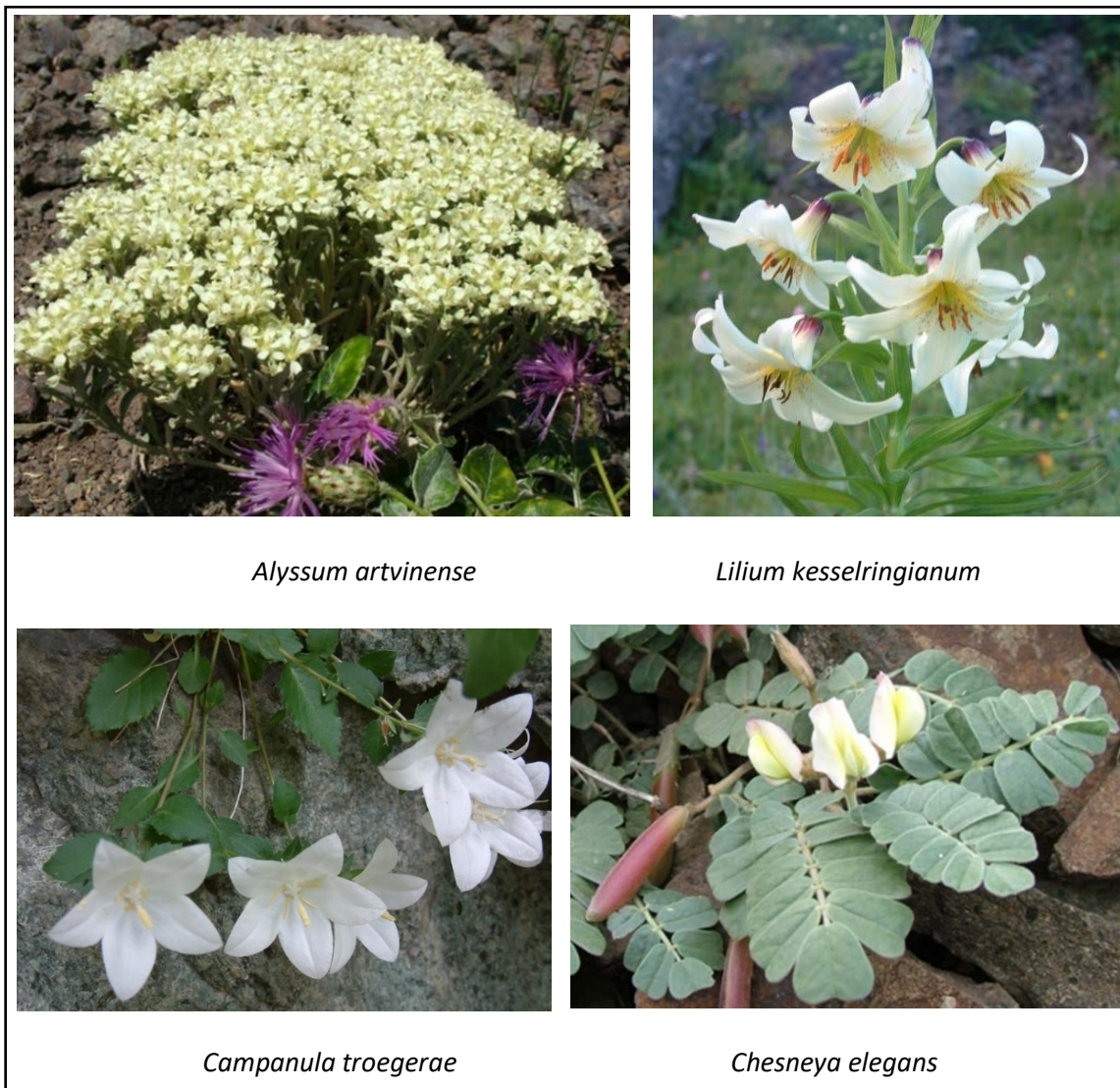
Figure 3. Some important endemic and non endemic taxa